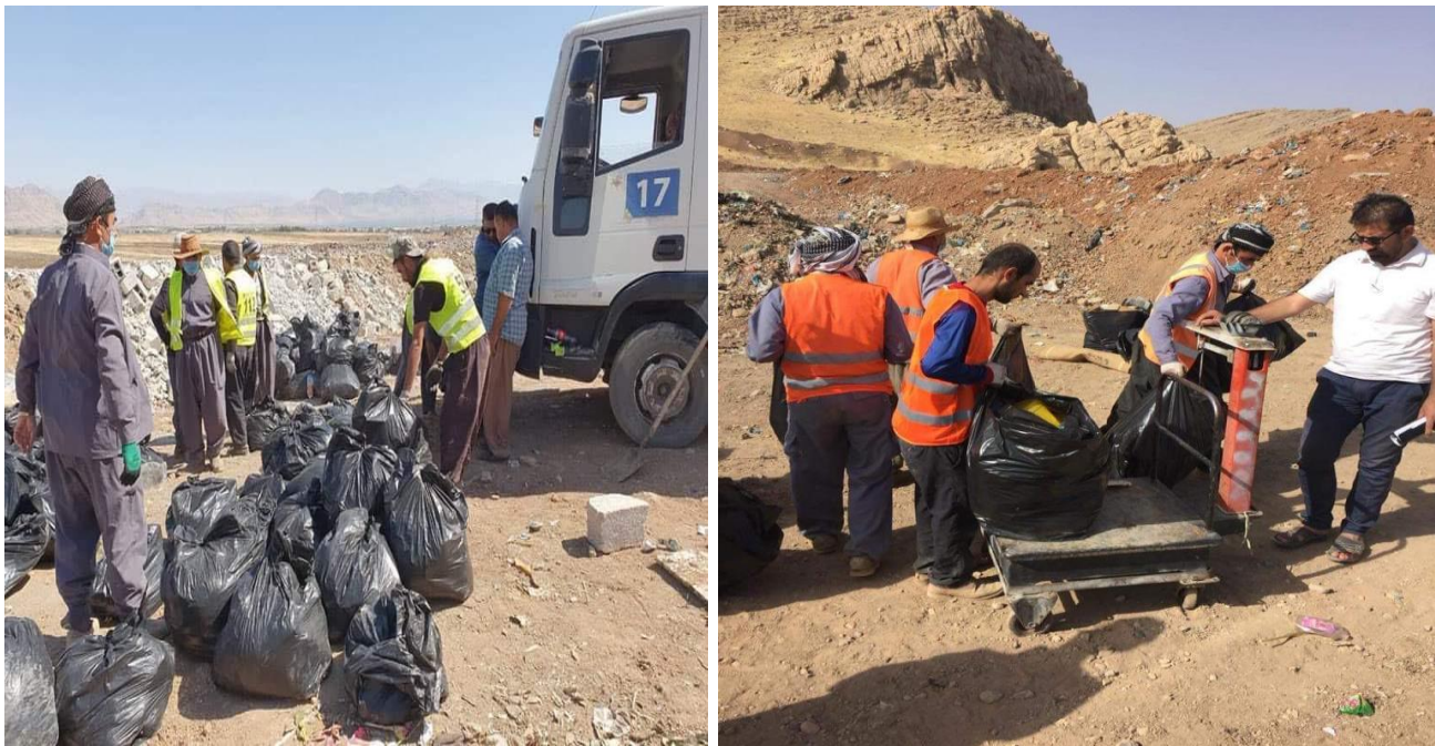
Fig. 4. Waste separation process, summer season.

z4=Bngrd, z5=Haji Awa, z6=Shkarta, z7=Sarwchawa, z8=Xdran, z9=buskin, z10=Sarkapkan, z11=Sanga saar, z12=Zharawa, z13=Halsho, z14=Hero, z15=Esewa, It depicts the Rania district as the hub of the 15 zones that make up the Raparin autonomous Administration. Using tipper lorries and compactor vehicles made specifically for moving rubbish to the disposal site, waste from each zone was collected separately. From each zone, one truck was chosen at random and weighed. After mixing the waste samples from each zone, the mixture was separated into four equal portions. After physically separating the components and weighing them with a digital balance, the proportion of each component was determined. Refer to Figure 4.