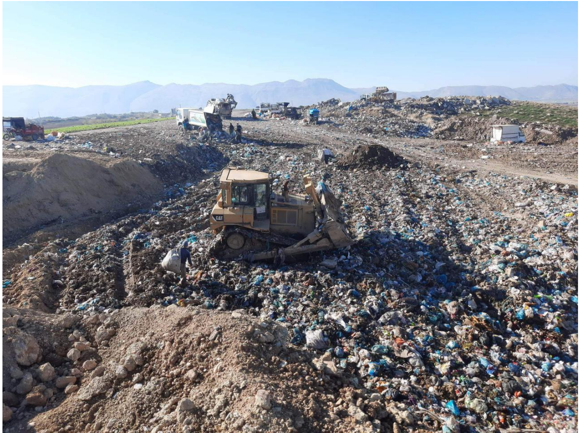
Figure 1 shows unscientific land fill without any treatment

Since 2014, the municipality of the Raparin Independent Administration has been tasked with overseeing the operations of Garrix Company, the contracted entity responsible for solid waste management in the area. The company employs various collection methods, including curbside pickup and community bin collection. However, their responsibility extends solely to the disposal of the entire district's waste at the designated site, without employing any treatment or considering alternative measures such as recycling, reuse, composting, or incineration.